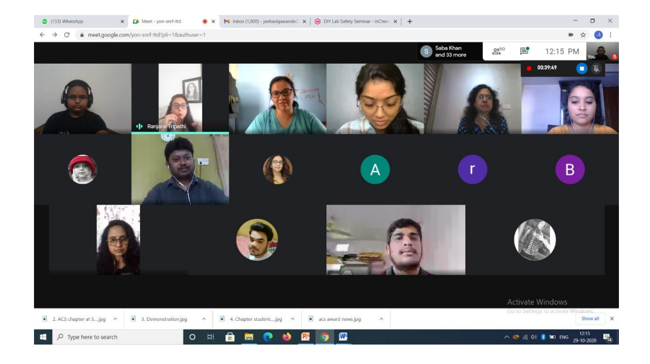
Attendees during the webinar